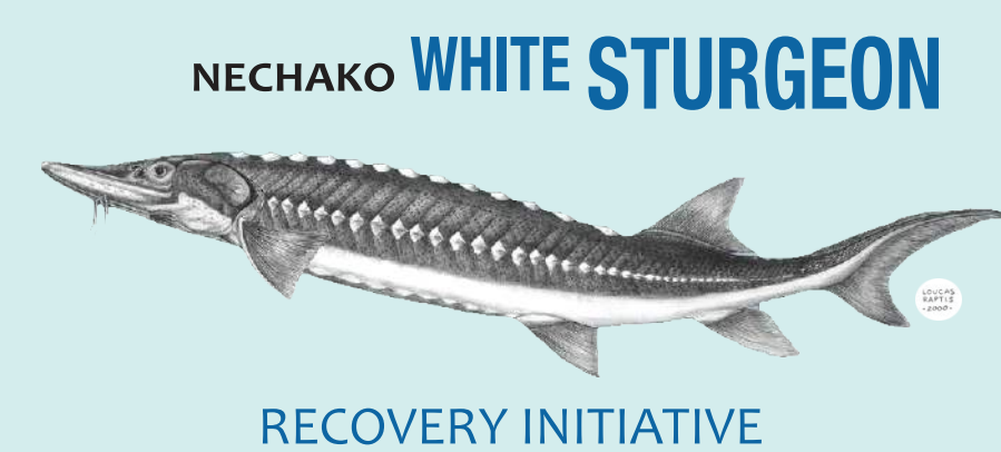
NECHAKO WHITE STURGEON

December 5: Young sturgeon are vulnerable to predation. Watch Video 4 and expand on how humans have played a role in sturgeon survival. December 12: Sturgeon are overwintering by now. Watch Video 8 to see sturgeon overwintering. What makes critical overwintering habitat? January 3: Welcome back to school! The NWSRI is finishing another year of recovery work on sturgeon. Have a look at the year in review NWSRI projects. January 16: Sturgeon have lived since the age of dinosaurs and have been important to First Nations families for generations - watch Video 6 to learn more, then explore sturgeon history and 'Unel'tsoo' . Think about the events of the last 100 years and their impact on sturgeon. February 14: Sturgeon researchers are planning summer research projects . (see Videos 6 & 7 too). Create your own sturgeon research project using 'Day in the life of...' as your starting point. February 20: Family Day! Show your family at least one sturgeon video from the YouTube page.