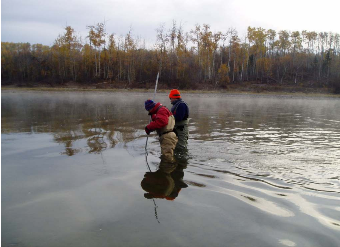
Plate: 3 Date: October 11, 2006 Observation Method: Wading Comment: Depth, velocity and habitat measurements were taken where sturgeon were located.