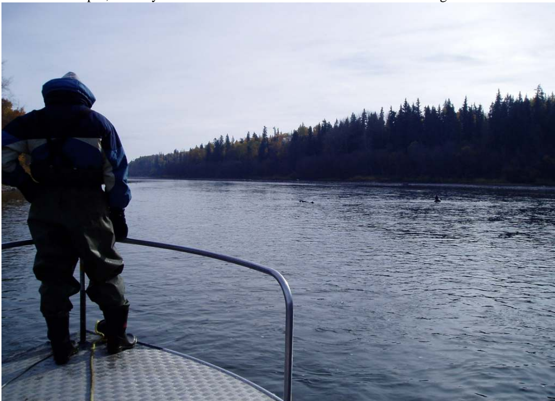
Plate: 4 Date: October 12, 2006 Observation Method: Boat Comment: Showing the boat observer in the shore lane, with two swimmers taking the center left of center lane.