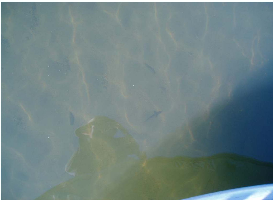
Plate: 2 Date: October 12, 2006 Observation Method: Boat Comment: Juvenile sturgeon on sand substrates downstream of the Vanderhoof boat launch.