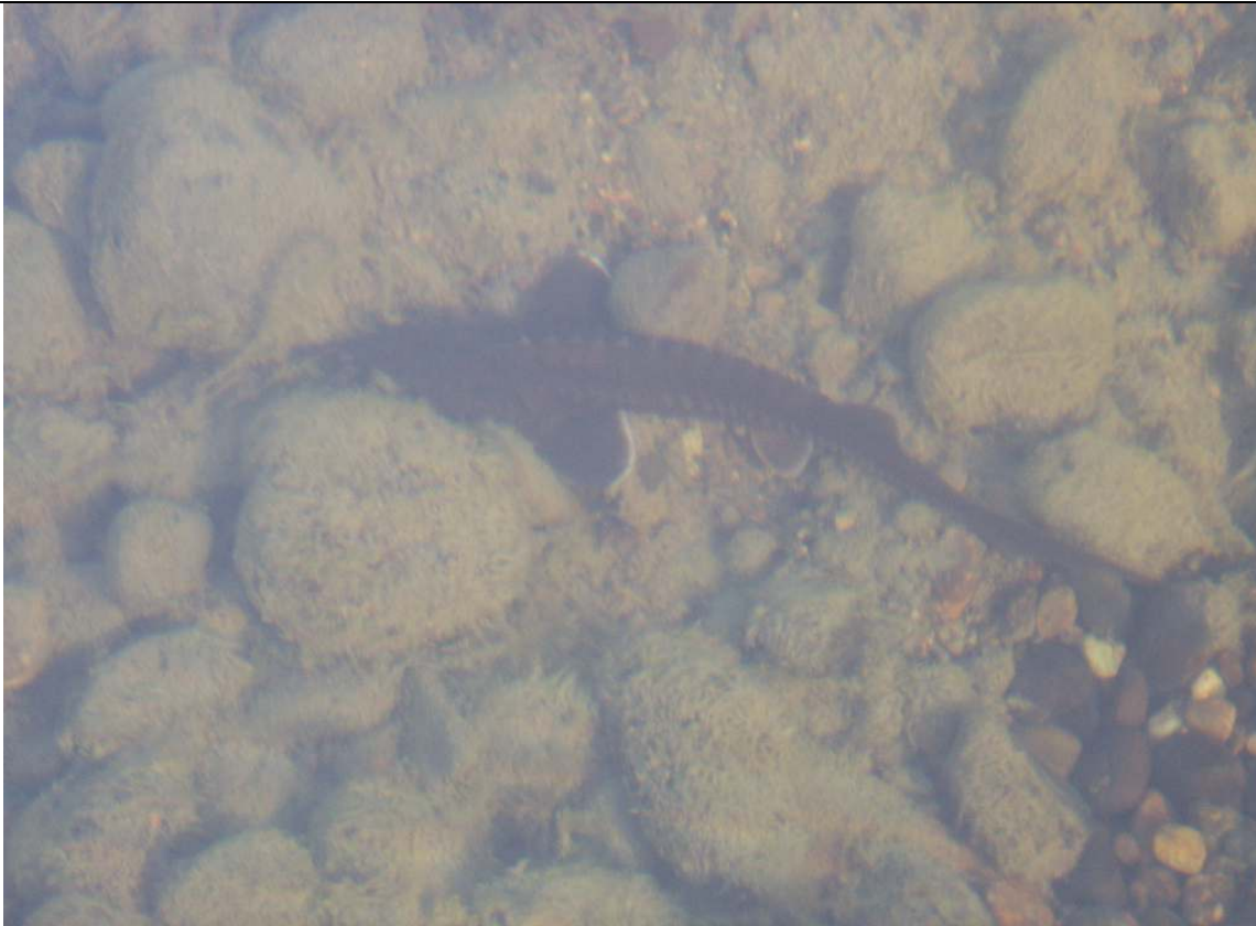
Plate: 1 Date: October 11, 2006 Observation Method: Wading Comment: Juvenile sturgeon on gravel substrates in the vicinity of the Vanderhoof boat launch.